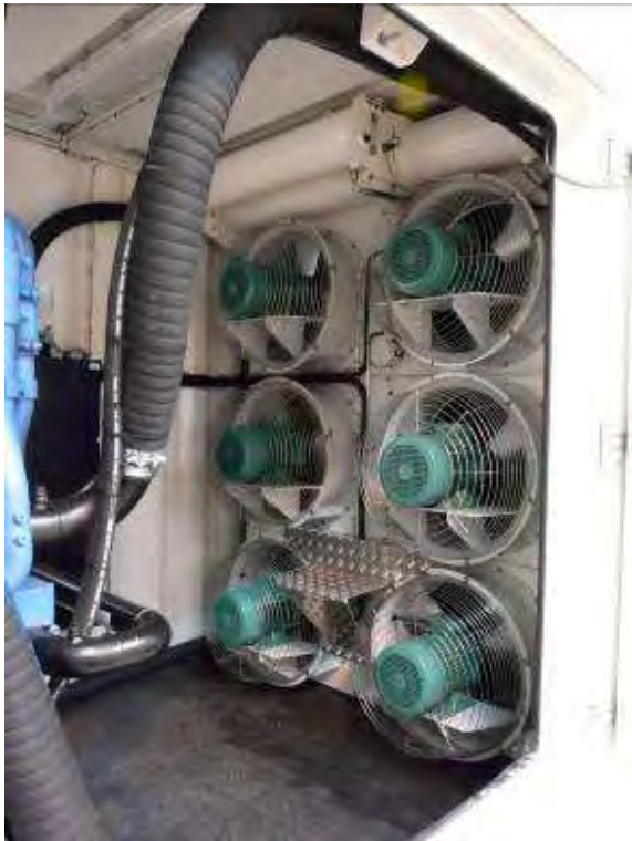
(Electrical Radiator with 6 fans)