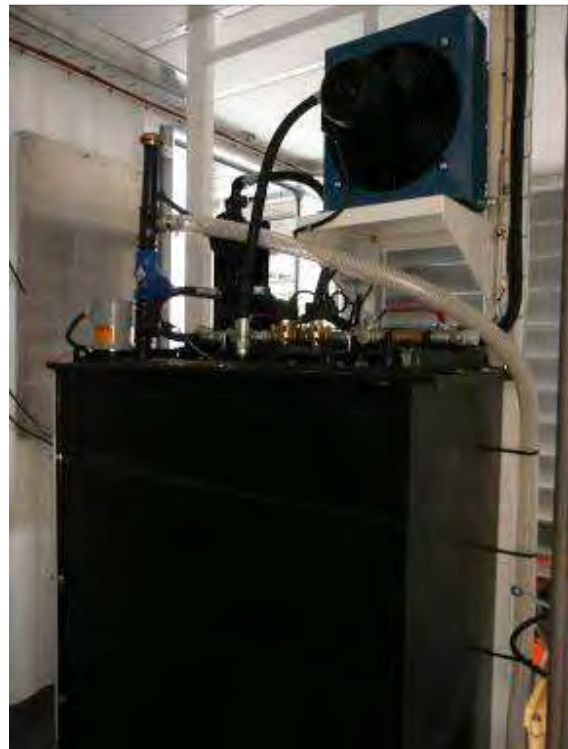
(Oil tank for Automatic filling of engine)