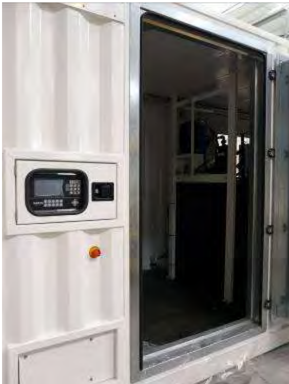
(Remote Touch Screen Panel)