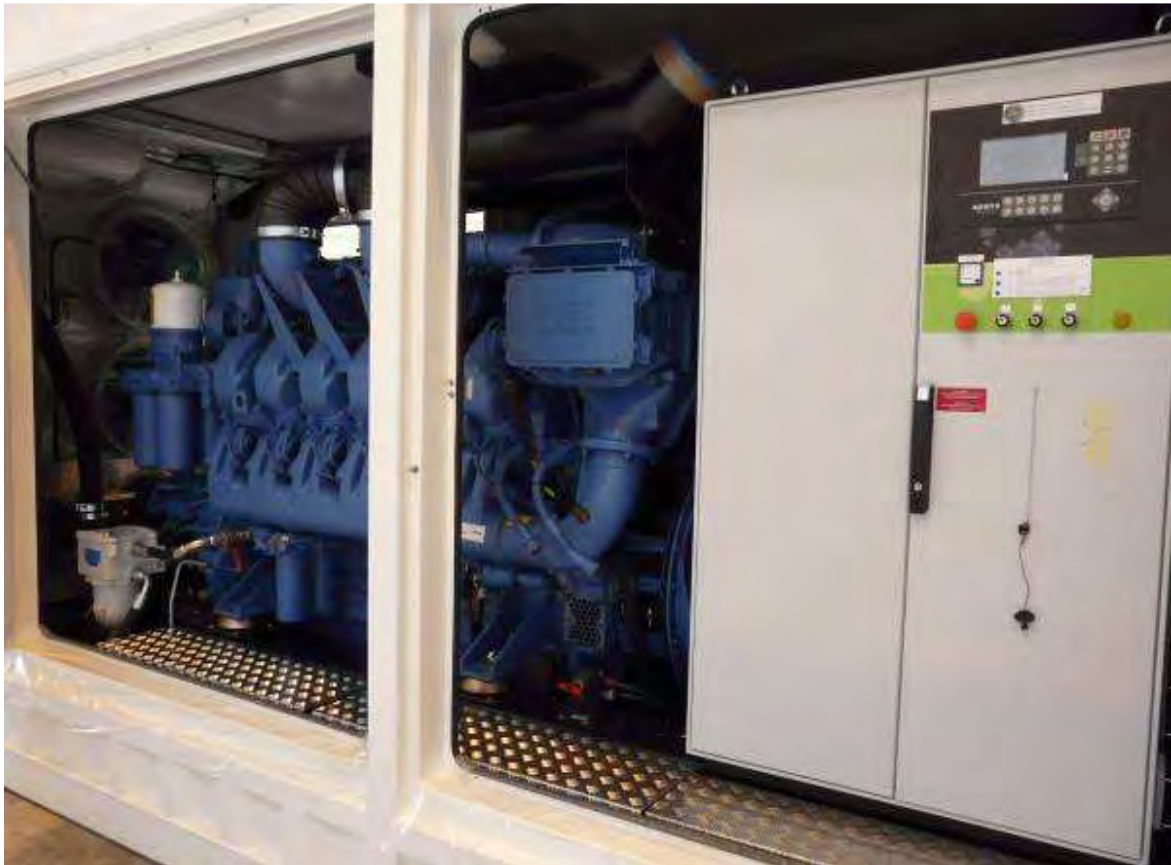
(Large Access Door + Free Standing Panel)