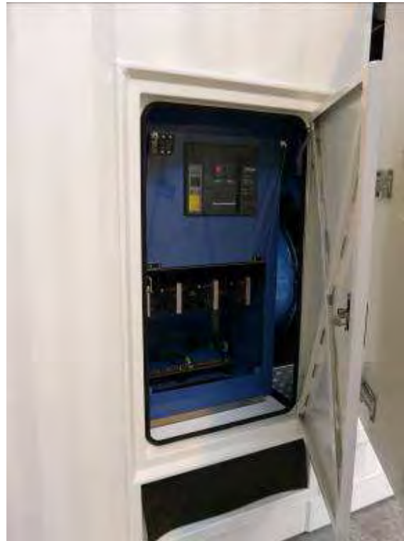
(2500A Motorized CB with Easy Access)